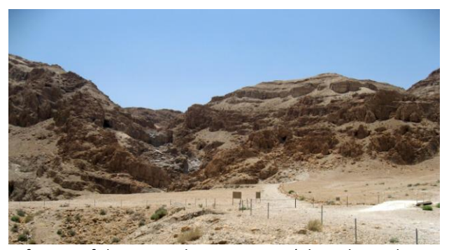
View of some of the caves above Qumran

Continuing with the most common version, in April 1947, the Bedouin(s) brought the scrolls to Bethlehem, and offered them for sale to two antiquities dealers. Eventually three scrolls were purchased by Faidi Salahi (it is said, for $14) and four by the mysterious Khalil Iskander Shahin (a.k.a. Kando). From this point, the story becomes a bit clearer.