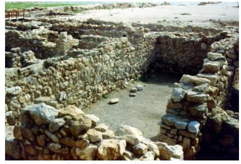
The "scriptorium" at Qumran

• Father de Vaux excavated a room where he found two inkwells (a third was later found in another room) and some strange shelf-like objects. Interpreting that the shelf-like objects were desks, he promptly christened the room the "scriptorium" (a medieval monastic term), and decided that this was where the scrolls must have been written.