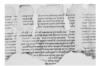
War Scroll

"The War of the Sons of Light with the Sons of Darkness", often shortened to simply the "War Scroll", describes a war between the forces of the "sons of light" against the sons of darkness, led by Belial. The scroll itself measures 9' x 6", and is written in 19 columns. The scroll begins with: