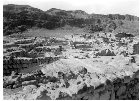
Qumran in the late 1940s-early 1950s

The period of time related to the theory that the site is connected with the sectarians is from the reoccupation in the 2<sup>nd</sup> century B.C. to the destruction in 68 A.D. This time period, of course, correlates roughly with the estimated ages of the scrolls.